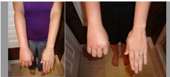
Left: Prior to Treatment | Right: Day 1 post Treatment